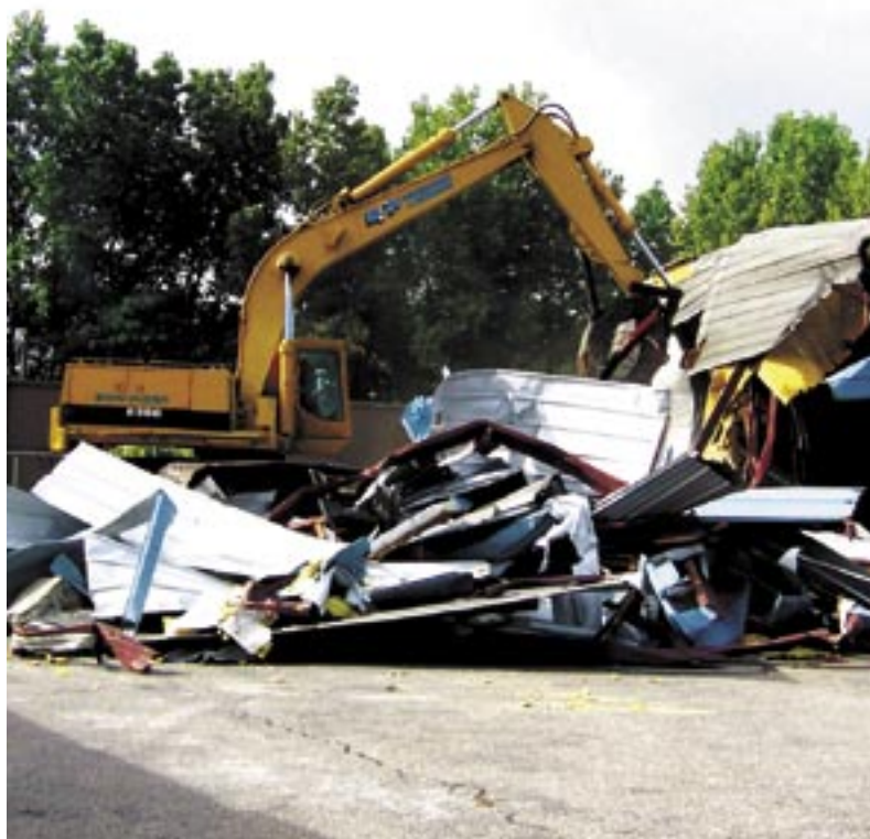
Tearing Down the Old to Build the New: Demolition and clearing has begun on the site of the new 375 Allens Ave. Clinic

PCHC is pleased to announce that work has begun on a proposed 11,000 square foot facility that will provide more services to more of our constituents. Located at 375 Allens Ave., the new site will replace the Fox Point Health Center currently located in the Boys and Girls Club on Wickenden Street in Providence, which we have outgrown.