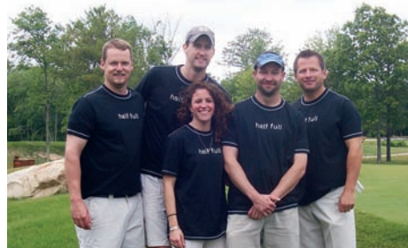
Tournament winners in the Net Gross category, the foursome half full.

The PCHC First Annual Golf Tournament was held on June 13 at the Shelter Harbor Golf Club in Charlestown, Rhode Island. Golfers, sponsors, spectators, supporters and curious onlookers came from all over New England and as far away as New Jersey to participate and to show their support.