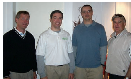
Tournament sponsors Neighborhood Health Plan of Rhode Island.

Many players commented that Shelter Harbor was the best course they had ever